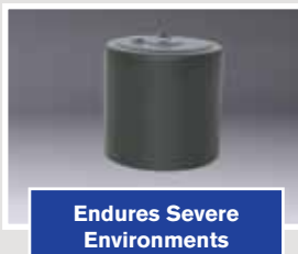
Endures Severe Environments