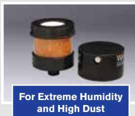
For Extreme Humidity and High Dust